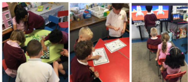
Y1 children enjoying playing different number games.

In RE this week, children have started their new branch of learning, Dialogue and Encounter . Pupils will learn how Christians work together with people of different religious convictions and all people of goodwill towards the common good, respecting the dignity of all humanity. They will also encounter other pathways of belief drawing on the teaching of the Church about intercultural dialogue