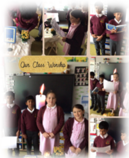
Y4/5 children planned a beautiful Prayer and Liturgy for their class.