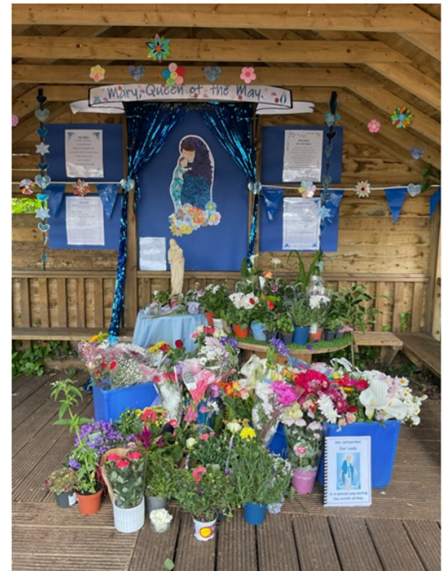
Annual May Procession

We join as a school and Parish community to celebrate Mass at St Mary's Catholic Church.