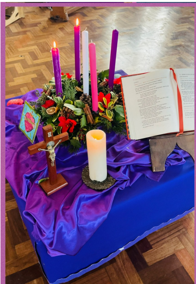
Prayer Table at Advent